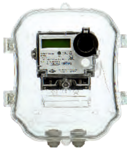
Meter Cupboard with Hinge type locking arrangement moulded in Transparent Engineering Plastic